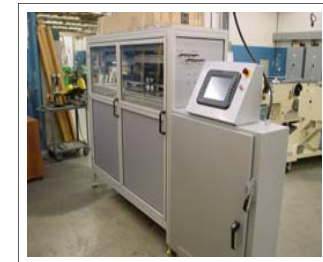
Custom Machinery Designed for Your Application

Our Commercialization Department focuses on expanding your product's ability to achieve success. We can provide everything you need to incorporate machinery into your plant with the fewest headaches. Is your prototype design ready for mass production? Anderson Machine can provide commercialization and technical support for equipment designed in-house or by our customers. For more information check our website.