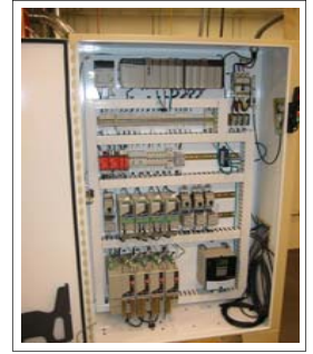
Electrical Panel Design

graded through the use of modern machine controls and multi-axis coordinated motion control. New and old equipment will benefit from using cutting-edge controls and motion products from such manufacturers as Allen-Bradley, Siemens, Yaskawa, and Omron. For more details check our website.